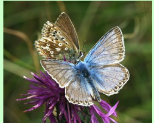
Chalkhill Blues

Nationally, the adult season began in May with a few butterflies believed to be hybrids between Chalkhill Blue and Adonis Blue ( L. bellargus ). None of these was in the UTB area. Our region's first report (29th June, Berkshire), was also the first in the UK and though this solitary butterfly was followed very quickly by a sprinkling of sightings across the south of the UK, it was some 20 days ahead of a more general emergence locally.