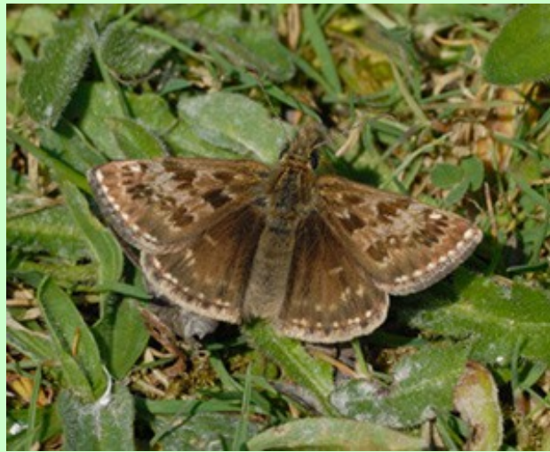
Dingy Skipper

In 2009 the Dingy Skipper was first recorded flying in Kent on 11th April. This year the Upper Thames region was not far behind, with activity recorded from 19th April (first sightings at Grangelands, Bucks and Aston Upthorpe Downs, Oxon) until 13th June (last sightings at Westcott, Bucks and Swyncombe Down, Oxon). This was a more typical flight period following the delayed start in 2008.