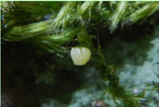
Egg laid on moss in a garden in Shipton-under-Wychwood, Oxon