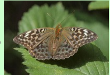
f. Valezina

In 2010 it was recorded in 6 woods in Bucks, 1 wood in Berks and, most surprisingly, a garden in Bucks. It will be interesting to see if Valezina numbers continue to rise in coming years.