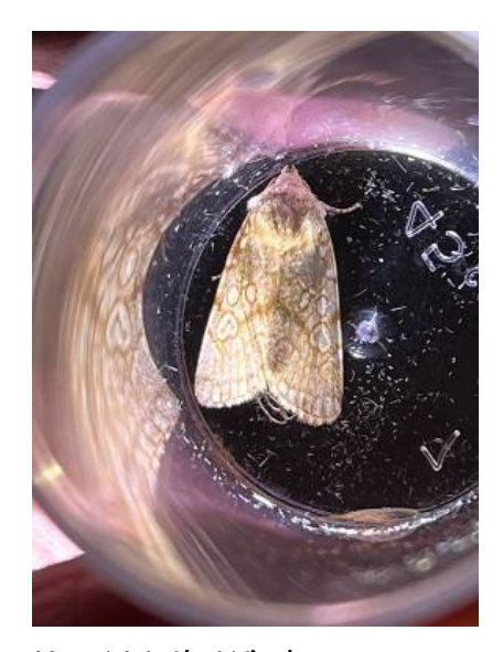
Heart Moth, Windsor

Heart Moth . This year's survey, on the 1<sup>st</sup> of July, targeted an area of Windsor Great Park that had not previously been trapped. We will aim to do this in future years as well, in order to better map the population of the species across the park. Three Heart Moths were recorded despite it being a rather cold night.