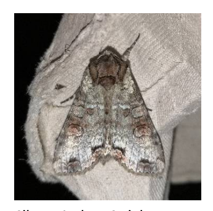
Silvery Arches, Swinley

<u>Silvery Arches.</u> A survey was undertaken at Swinley on 24<sup>th</sup> June to keep an eye on the small population at this site, last carried out in 2021. Three Silvery Arches were recorded. A larval survey had been planned for April, to see if we might get a better understanding of its requirements. Unfortunately this had to be cancelled due to heavy rain. Next year we are hoping to search other Berkshire heaths for this moth.