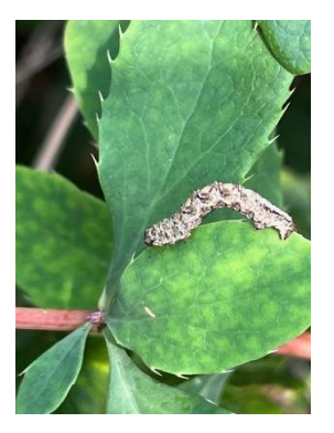
Barberry Carpet Iarva