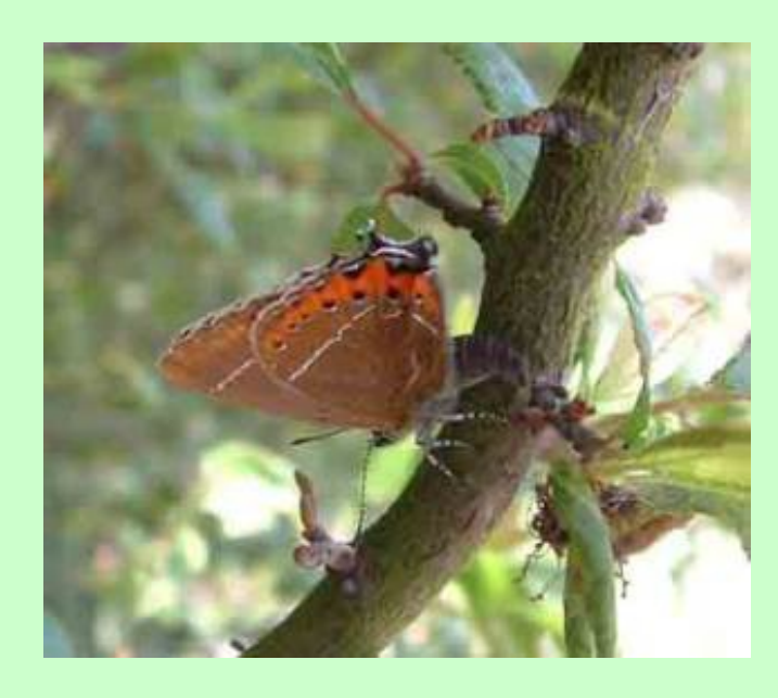
A Black Hairstreak having just laid an egg - photograph © Dave Wilton

One egg hatched 5<sup>th</sup> or 6<sup>th</sup> of April another found already hatched on the 15<sup>th</sup> and the last not until early June, leaving one speculating as to what would become of it.