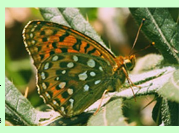
Dark Green Fritillary

A total of 22 reports in 2007 seems low compared to 10 years previously but is hard to interpret confidently. Several sites that previously held the Dark Green Fritillary did not feature but it is impossible to know if visits were made under appropriate conditions to confirm absence. There were no repeat records from various points that had returned sightings of presumed wanderers in 2006, but another record from Loosely Row in Bucks suggests a colony nearby.