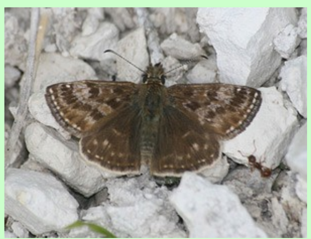
Dingy Skipper and friend on chalk at Ivinghoe Beacon, 17th May 2010

In 2010 the Dingy Skipper was first reported flying in Sussex on 13th April, while our own local first sighting came ten days later on 23rd April when it was recorded from Sands Bank at High Wycombe, Bucks and from Hartslock, Oxon. The last record was of five seen at Letcombe Basset, Oxon on 20th June so the butterfly could easily have been active somewhere in our region for two complete months. Unlike the previous year, in 2010 there were no reports of second brood specimens during August.