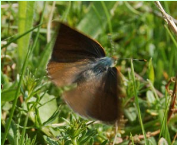
Green Hairstreak

Despite the very variable weather conditions I think it is possible, with reservations, to conclude that the Green Hairstreak had quite a good season. There were approximately 200 individual butterflies detailed within 61 reports, whereas in 2007 approximately 250 individuals were detailed within 91 reports. By comparison 2006 was a very poor year with approximately 140 individuals from 75 reports.