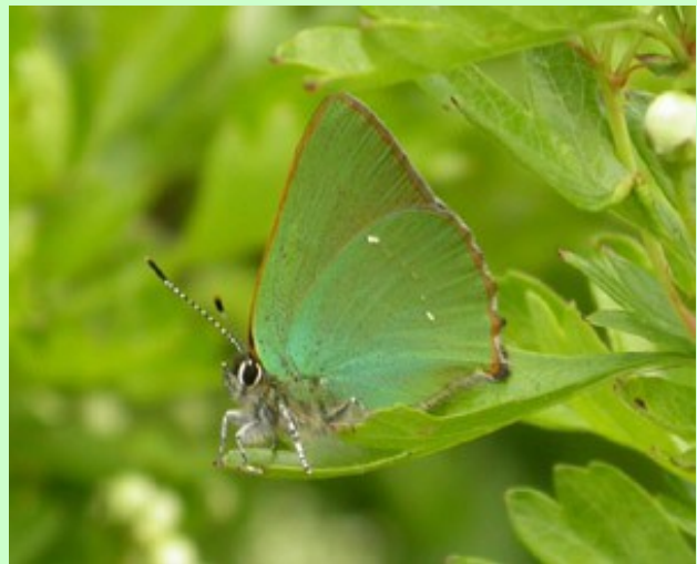
Green Hairstreak

The earliest national Green Hairstreak sighting was on April 14th at Magdalen Down in Hampshire and the first Upper Thames record was at Sands Bank on the western outskirts of High Wycombe on April 25th. The last week of April was marked by westerly winds which brought spells of rain and showers some of which were heavy and thundery with hail. It's hardly surprising therefore that the next Green Hairstreak sightings had to wait until May 3rd from several locations from Dancersend to Wytham Woods.