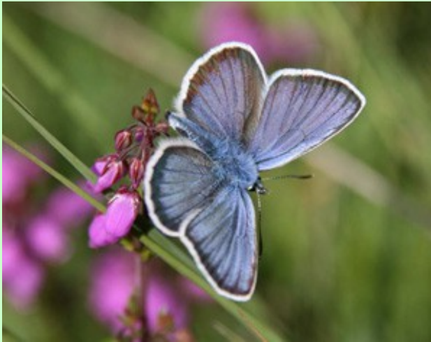
Silver-studded Blue (male)

Although the small colony of Silver-studded Blue ( Plebeius argus ) at Broadmoor Bottom had a surprisingly good year, it is too small to be viable long term.