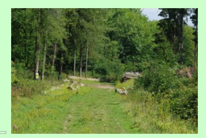
Homefield Wood main ride (Summer 2010) - click images to enlarge