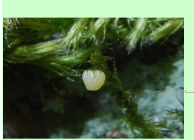
Egg laid on moss in a garden in Shipton-under-Wychwood, Oxon

Whitecross Green Wood, Oxon, will also be interesting to watch as the trees are being thinned out during this winter which will allow more light into the wood. A mating pair of Silver-washed Fritillary was recorded in the wood this year.