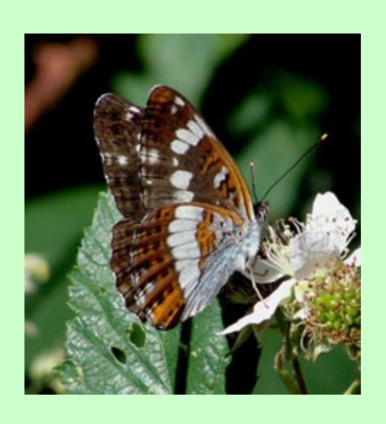
White Admiral

The first sighting was on 16th June (2009 - 16th June) and the last on 9th August (2009 - 2nd August). There were 8 occasions in June and July when daily sightings in excess of 10 were recorded. There were 95 individual sightings reported (2009 - 102) and my thanks are extended to the 39 members (2009 - 36) responsible for these invaluable records.